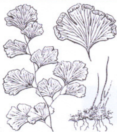
Adiantum capillus-veneris - Capil-lera