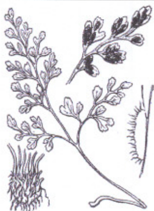
Asplenium ruta-muraria - Falzia blanca