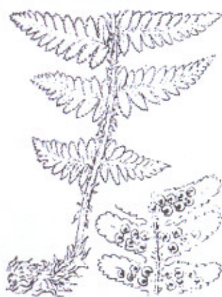
Dryopteris filix-mas - Falguera mascle