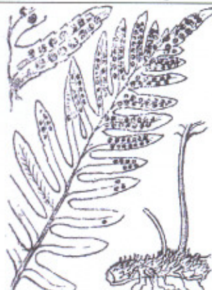
Polypodium vulgare ssp. vulgare - Polipodi