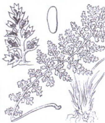
Asplenium fontanum - Falguereta de cingle