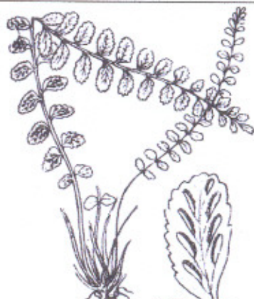
Asplenium trichomanes - Falzia roja